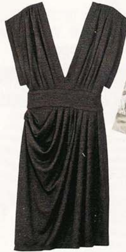
JERSEY, $288, MINT. POPPY, NYC, 212-219-8934

This style is everywhere for fall, and it's great news: The combination of an extra-thick waistband and a neckline that's on the barer side makes just about anyone appear smaller around the middle.