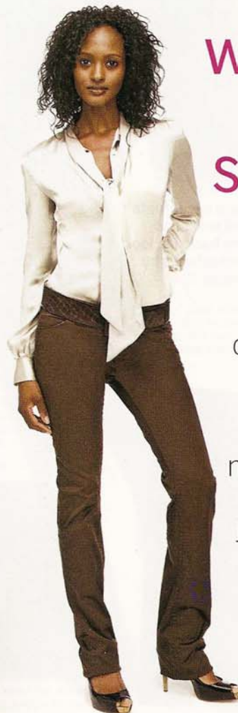
SILK CHARMEUSE BLOUSE, $295, MASON BY MICHELLE MASON. SELECT BARNEYS NEW YORK, 888-8-BARNEYS. STRETCH SATIN PANTS, $129, BEBE.COM. PATENT-TRIM SUEDE BELT, $48, CALVIN KLEIN. SELECT MACY'S, 800-343-0121. PATENT LEATHER "MERRI" SLINGBACKS, $99, GUESS FOOTWEAR, GUESS.COM

Going head to toe in this gleamy material can actually look really sleek (as opposed to really disco): Keep the palette neutral and make sure one piece—like these pants—has just slightly less sheen than the other.