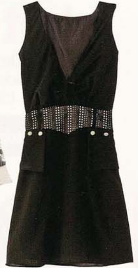
COTTON BLEND, $285, ESHELL, 773-477-9390